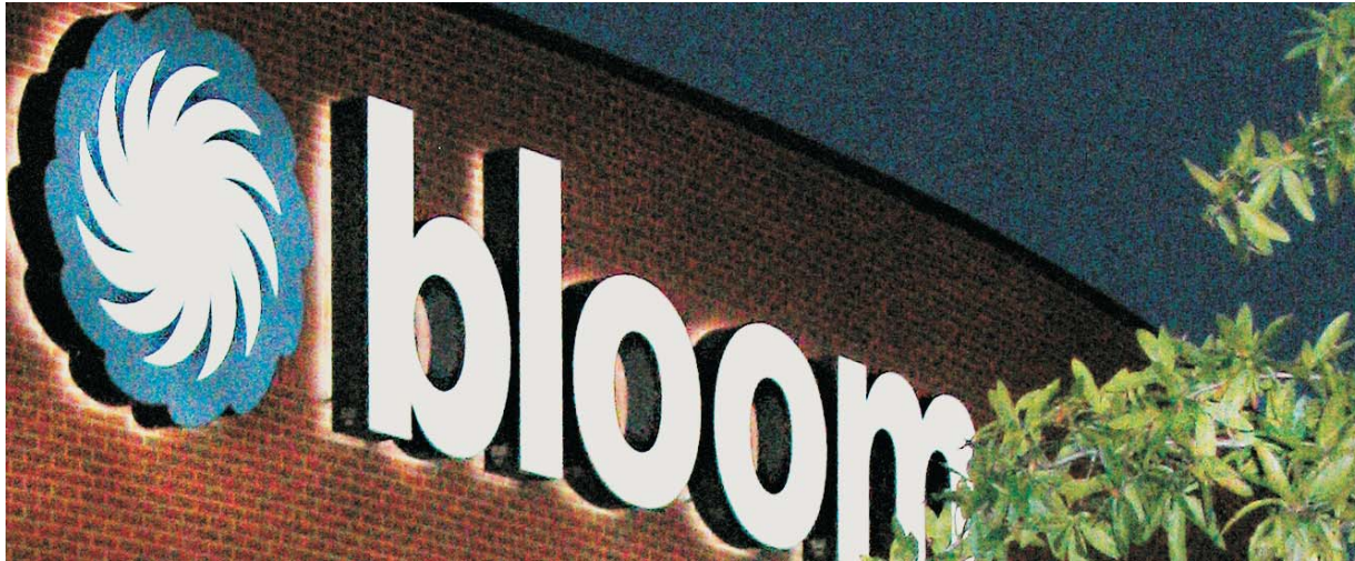
Food Lion / Bloom Markets

We created a new brand for a new way to buy groceries and business is blooming.